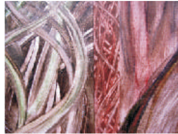
Dark Forest 3, Detail (Right)

D ark Forest focuses on energy flow in the natural world. The viewer is in the undergrowth, the ground level where trunks, thick limbs, branches and vines — all powerful symbols of our unconscious, our DNA, our neural net, and our sinewy bodies—swirl in their interpenetrating dance as they strive for higher levels of illumination. And this quest is the journey into the symbolic dark forest we each carry within.... and then beyond into the clearings ahead, where the light vibrates...drawing us on.