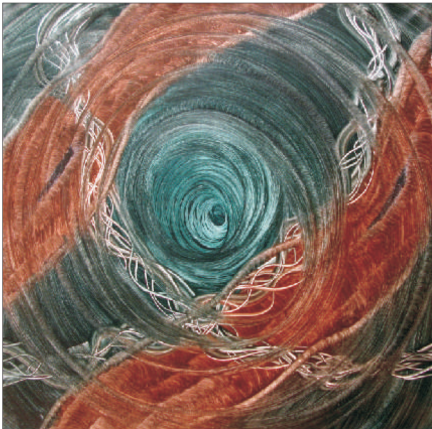
Dark Forest 8, Oil on canvas, 42x42 inches, 2008 (Bottom)