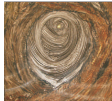
Dark Forest Study 4, Oil on clay paper 16x20 inches, 2008 (Below)