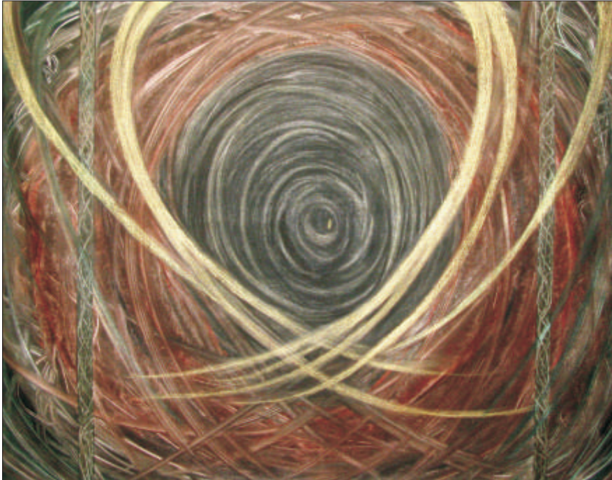
Dark Forest 5, Oil on canvas, 62x48 inches, 2008