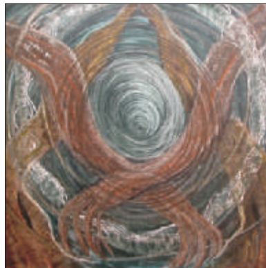
Dark Forest 11, Oil on canvas, 42x42 inches, 2008

Recent Indian solo exhibits: Government Museum, Chandigarh, October 2007 Nicholas Roerich Museum Gallery, Naggar, October 2006